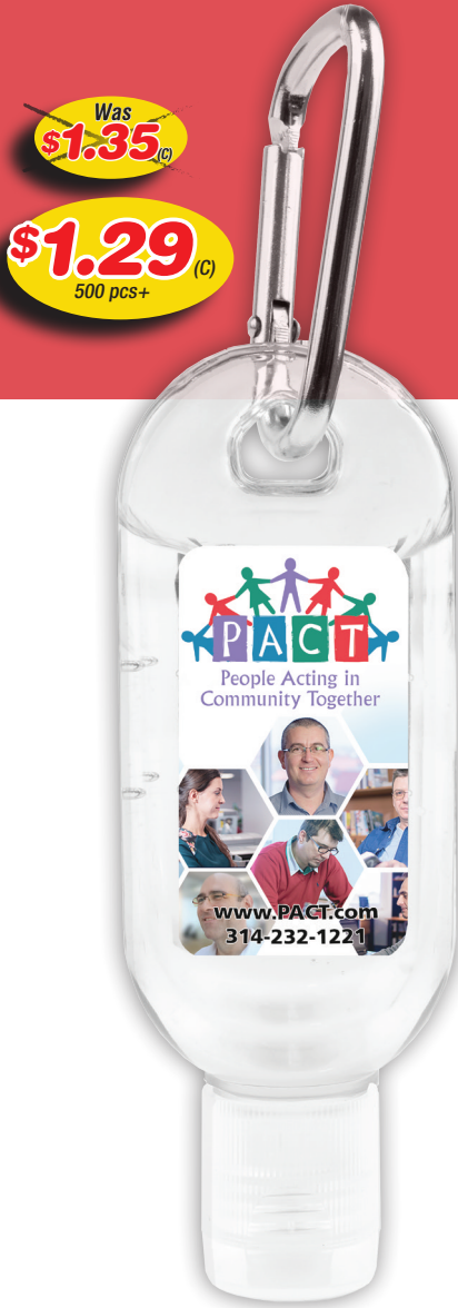
#5248 Shown with Multicolor Vinyl Label*