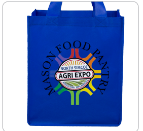
#923 Shown with Optional PhotoImage ® Full Color Imprint*