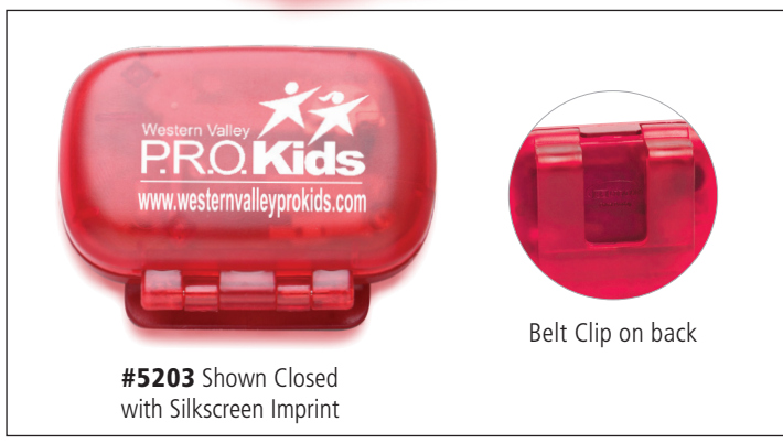
#5203 Shown Closed with Silkscreen Imprint