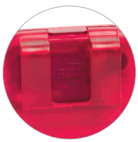
Belt Clip on back