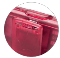
Belt Clip on back

#5203 Single Function Step Counter Pedometer with Hinged Cover Size: 2" W x 1-1/2" H Imprint: 1-1/4" W x 7/8" H Weight: 12 lbs. (100 pcs.) Color: ■ Trans Red Only