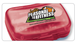
#52054 Shown with PhotoImage® Full Color Imprint*

*Disclaimer: Promotional Pedometers provide an approximate step reading and cannot be used for professional measuring. Their accuracy cannot be compared to electronic/digital step measuring devices. Please note: Slight shifting of logo/text cannot be avoided. As each product is manufactured and logoed individually, up to 3/16" movement in logo alignment may occur. Products are intended for individual use and cannot be compared one to another. In Photoimage color printing, exact color match cannot be achieved. There may be a dramatic difference between the PMS Color noted, screen color shown and printed color. None of these can be considered a defect. 0719