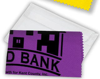
Optional Blank Vinyl Pouch

Setup Charge: 55.00 (G) per location. Price includes: One color imprint on cloth. We recommend black imprint on all cleaning cloths. If customer orders other imprint colors, factory cannot guarantee results or accept returns. For a complete list of available imprint colors based on cloth color, please visit our website for this item. Assorted Colors: Minimum assortment per color is 100 pieces and must be in even increments of 100 pieces (sorry, no exceptions). If ink change is required, please add 40.00 (G) per change. Email Proof: 7.50 (G), add 2 days to production time. Repeat Setup: 20.00 (G). Standard Packaging: Bulk. Production Time: 5 Days. Weight: 2-1/2 lbs. (250 pcs.) Material: 170GSM Microfiber.