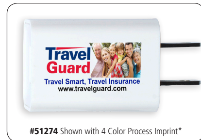
#51274 Shown with 4 Color Process Imprint*

Setup Charge: 50.00 (G) per color. Price Includes: One color imprint, one location. Additional Colors/2nd Location: .30 (G) running charge. PMS Color Match Charge: 40.00 (G) per color, not available for Full Color Imprint. *4 Color Process Setup Charge: 50.00 (G), plus .40 (G) running charge. (Exact color match for Full Color Imprint is not guaranteed). Email Proof Charge: 7.50 (G), add 2 days to production time. Repeat Setup Charge: 25.00 (G). Production Time: 5 days. Packaging: Polybag. Weight: 3-3/4 lbs. (100pcs.).