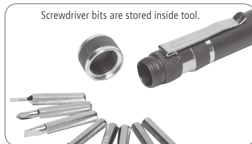
Screwdriver bits are stored inside tool.

8 Steel bit sizes: 1.5/2/3/3.5 mm Flat Head bits and PH00, PH0, PH1, PH2 Phillip bits