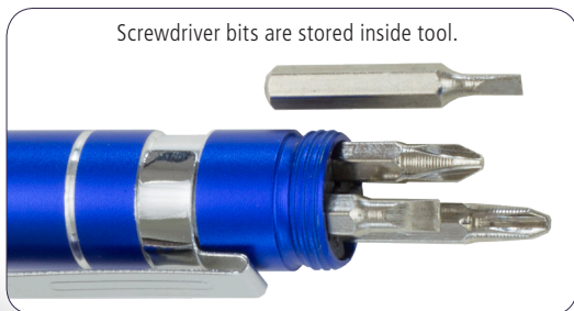
Screwdriver bits are stored inside tool.

Screwdriver bits are stored inside tool. 6 Steel bit sizes: 1.5/2/3 mm Flat Head bits and PH0, PH1, PH2 Phillip bits