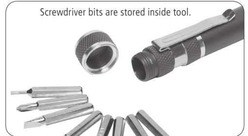
Screwdriver bits are stored inside tool.