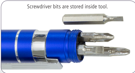
Screwdriver bits are stored inside tool.