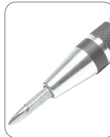
Magnetic Slot Securely Holds Bits.

Screwdriver bits are stored inside tool. 6 Steel bit sizes: 1.5/2/3 mm Flat Head bits and PH0, PH1, PH2 Phillip bits