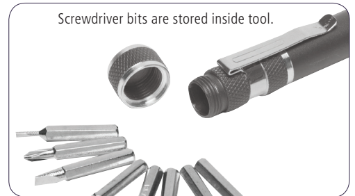
Screwdriver bits are stored inside tool.

8 Steel bit sizes: 1.5/2/3/3.5 mm Flat Head bits and PH00, PH0, PH1, PH2 Phillip bits