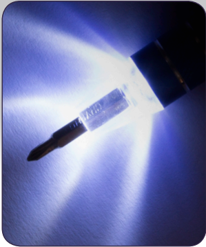
Front lights up to allow working in light restrictive areas

Pocket Toolkits are Great for the House or Car