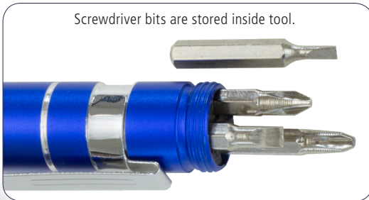
Screwdriver bits are stored inside tool.

Screwdriver bits are stored inside tool. 6 Steel bit sizes: 1.5/2/3 mm Flat Head bits and PH0, PH1, PH2 Phillip bits