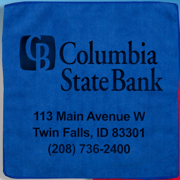
Optional Imprint Area