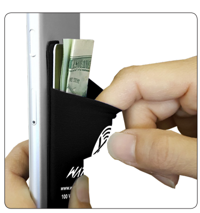
Stretchy Elastic Fiber Material Large Capacity - Can hold up to 8 credit cards or 10 business cards.