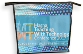
All Table Covers Come In A Clear PVC Zipper Bag At No Additional Charge

Full Color Sublimation Screen Setup Charge: 55.00 (G). Price Includes: all over full color dye sublimation imprint. Email Proof: 7.50 (G), add 2 days to production time. Repeat Setup: 40.00 (G). Production Time: 7 days. Material: 300D Polyester. Packaging: Clear Zipper Bag. Weight: 6 Foot: 2-3/4 lbs each, 8' Foot: 3-1/2 lbs each