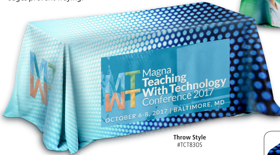
Throw Style #TCT830S