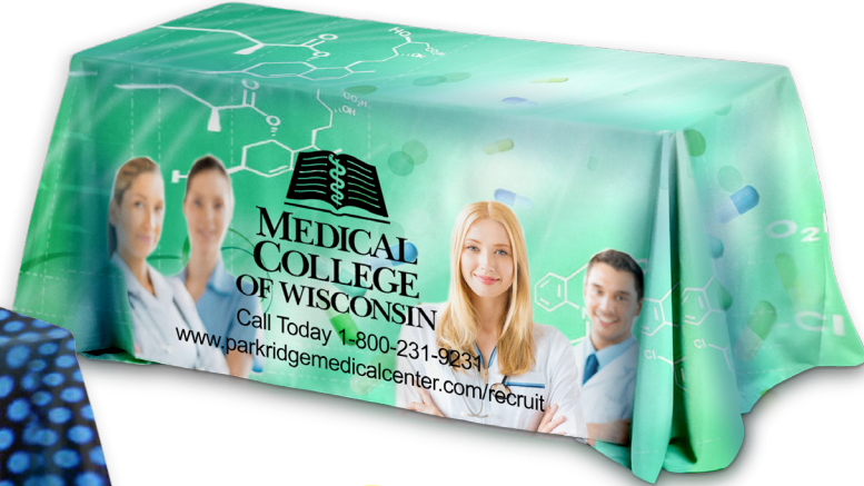
Throw Style #TCT630S

Was $170.00 (C) As Low As $155.00 (C) 10 pcs+