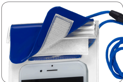
Triple-Safety Seal - Two Fastener strips and an extra thick hook and loop closure

Fits Larger Phones Including Plus Size iPhone® & Samsung® Large Pocket 7-3/4" H x 3-1/2" W