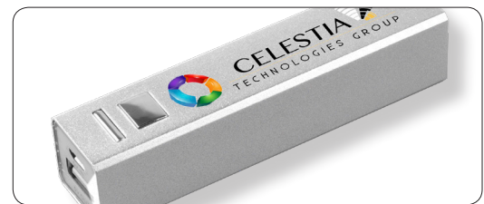
#PB1024 Shown with Photolmage © Full Color Imprint*