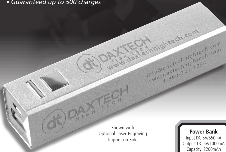
Shown with Optional Laser Engraving Imprint on Side