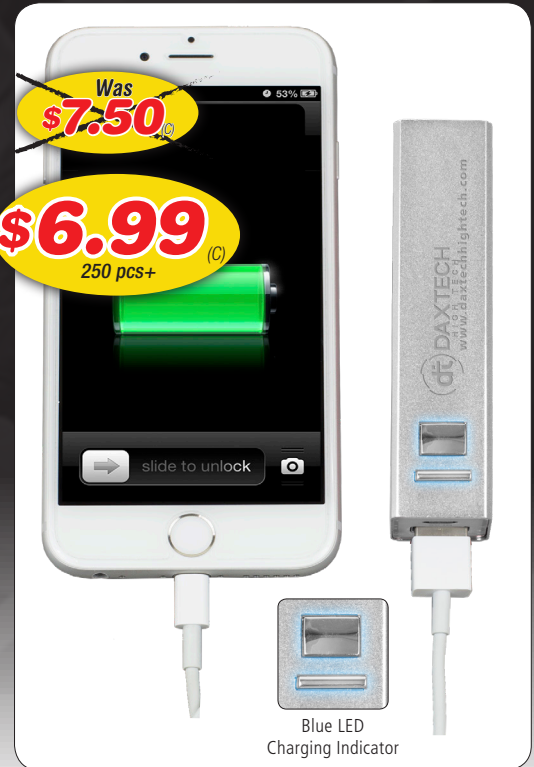
Ideal for charging mobile phones