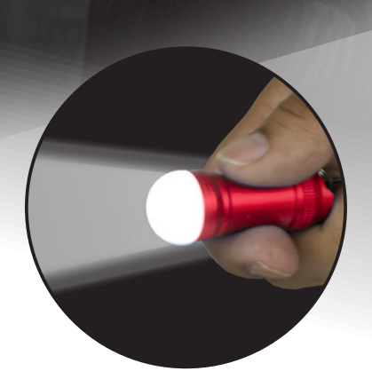
Super Bright LED Light