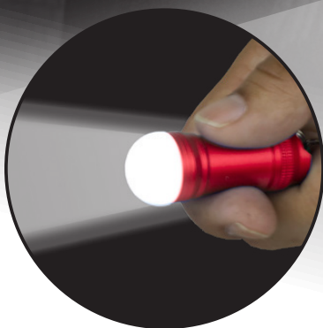
Super Bright LED Light