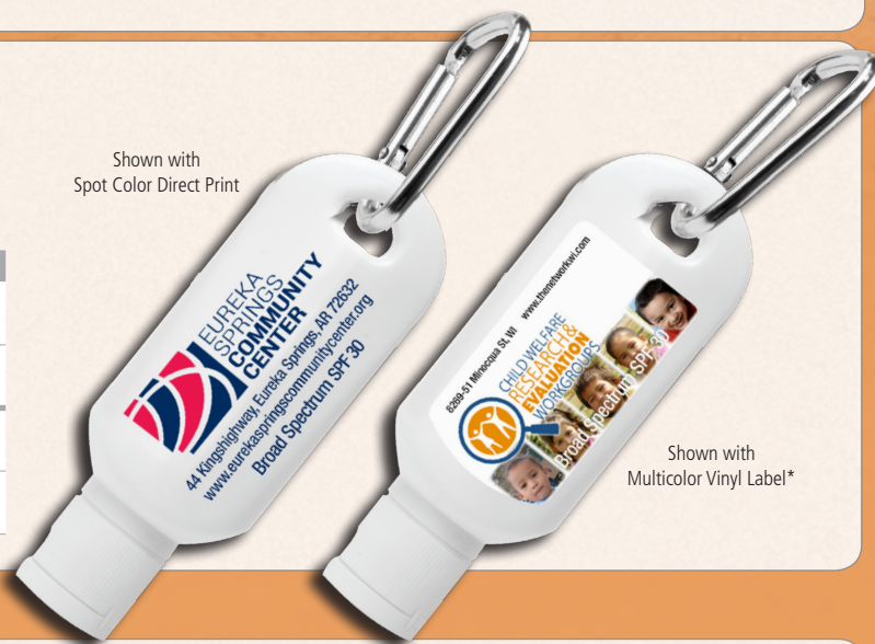
Shown with Multicolor Vinyl Label*