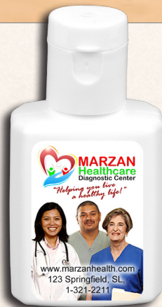
Shown with Multicolor Vinyl Label*