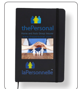
#9214 Shown with 4 Color Process Imprint*

Please note: Slight shifting of imprint cannot be avoided when printing or laser engraving. Each product is manufactured and printed individually so up to 3/16" movement in logo printing alignment is acceptable and cannot be considered a defect. Products are intended for individual use and not for comparison to one another. 0924