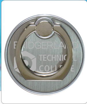
Shown with Ring In Standard Position