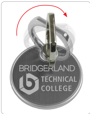
Twisting ring for flexibility while holding or as stand