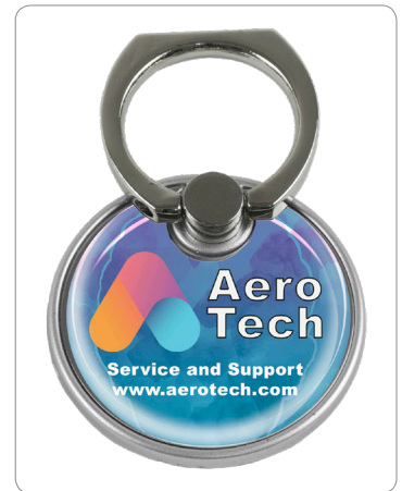
Shown with PhotImage® Full Color Imprint with Doming*