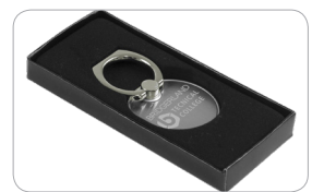
Gift Box included

*PhotImage® Full Color Imprint Setup: add .50 (G) running charge, plus 55.00 (G) Setup Charge. Price includes: up to a Full Color Imprint with Epoxy Dome, exact color matches are not possible. When Dome is applied slight metal indentation results on exterior of plastic ring, and this is not considered a defect. Add 3 Days to Production. Email Proof: 7.50 (G), add 2 days to production time. Repeat Setup: 25.00 (G). Production Time: 8 Days. Packaging: Gift Box. Weight: 9 lbs. (100pcs.) Material: Zinc Alloy, Plastic & Stainless Steel.