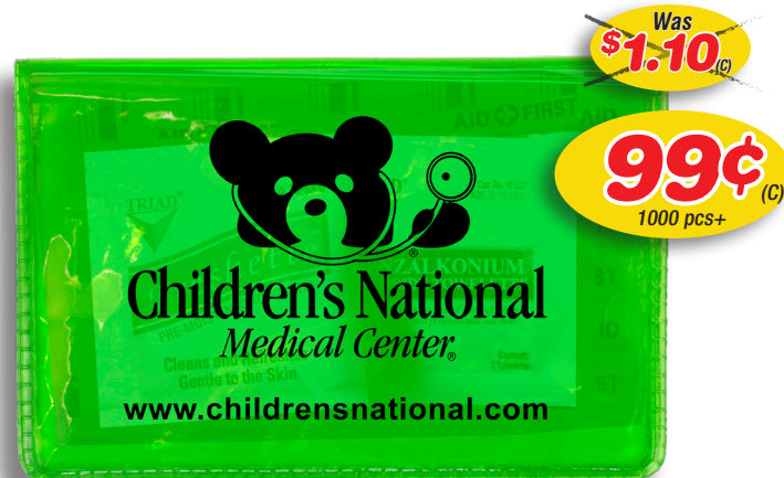
#5262 10 Piece Economy First Aid Kit in Colorful Vinyl Pouch