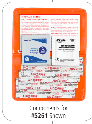
Components for #5261 Shown