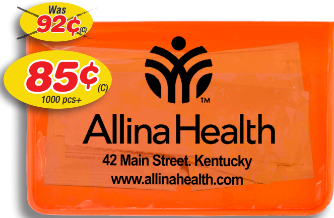
#5261 7 Piece Economy First Aid Kit in Colorful Vinyl Pouch