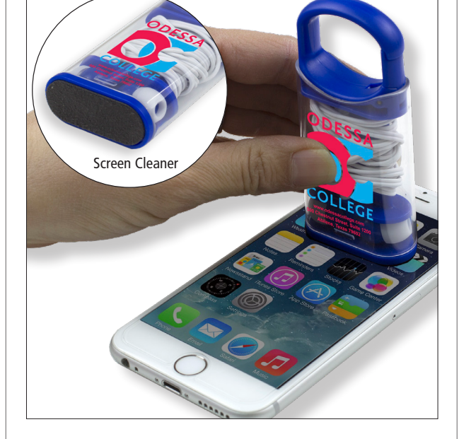
Shown with PhotoImage ® Full Color Imprint*

Screen Setup Charge: 55.00 (G) per color/location. Price Includes: One color imprint, one location. PMS Color Match Charge: 40.00 (G) per color, not available for Full Color Imprint. *PhotoImage ® Full Color Imprint Setup Charge: 55.00 (G), plus .30 (G) running charge. Price Includes: up to a Full Color imprint. Email Proof Charge: 7.50 (G), add 2 days to production time. Repeat Setup Charge: 25.00 (G). Production Time: 5 Days. Weight: 19 lbs. (250pcs.). Packaging: Cello Bag.