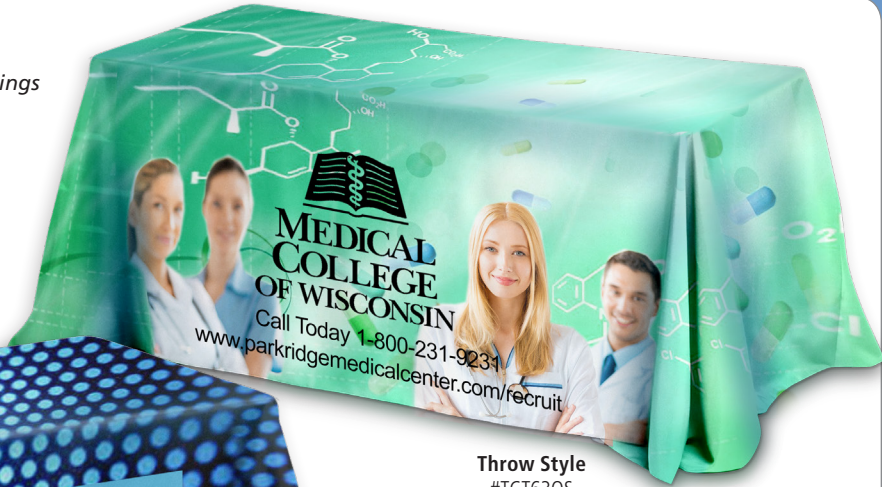
Throw Style #TCT630S