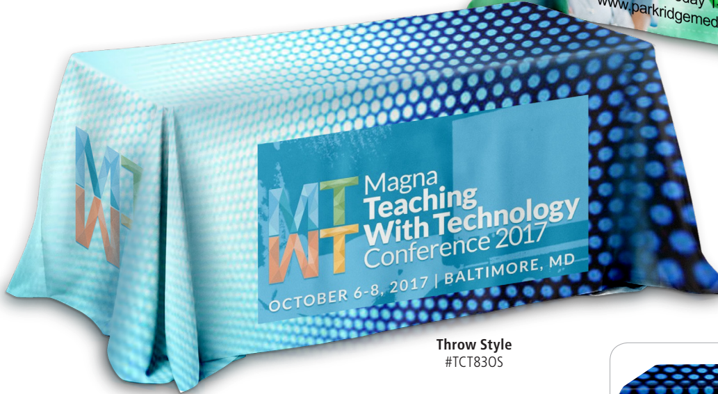
Throw Style #TCT830S