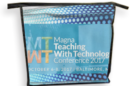
All Table Covers Come In A Clear PVC Zipper Bag

Full Color Sublimation Screen Setup Charge: 55.00 (G). Price Includes: all over full color dye sublimation imprint. Email Proof: 7.50 (G), add 2 days to production time. Repeat Setup: 40.00 (G). Production Time: 7 days. Material: 300D Polyester. Packaging: Clear Zipper Bag. Weight: 6 Foot: 2-3/4 lbs each, 8' Foot: 3-1/2 lbs each