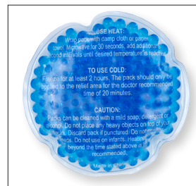
Use instructions printed on the back of each piece.