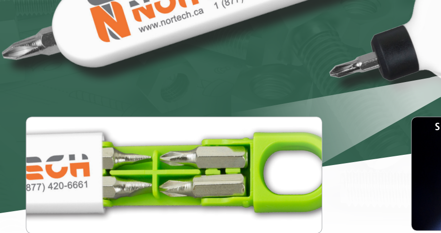
Slide Out Storage Compartment contains 4 Steel bit sizes: 4/5 mm Flat Head bits and PH0, PH1 Phillip bits