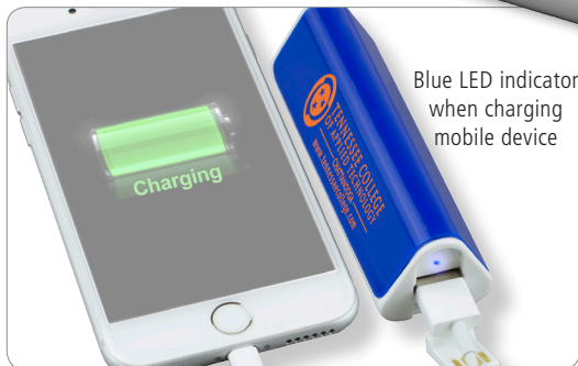
Blue LED indicator when charging mobile device