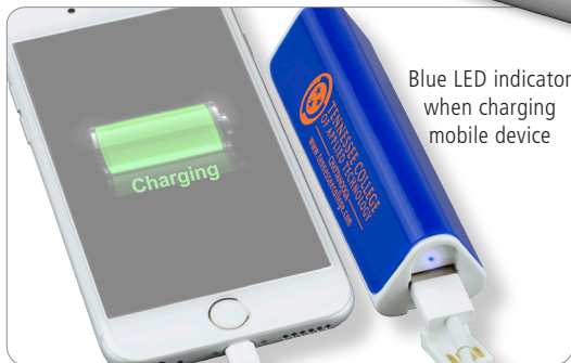
Blue LED indicator when charging mobile device