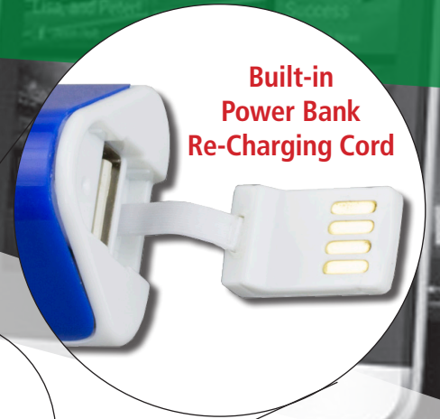
Built-in Power Bank Re-Charging Cord