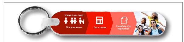
#5401 Shown with Optional Backside Imprint †

* Photolmage ® Full Color Imprint Setup Charge: 55.00 (G) for one-sided imprint or same artwork used on both sides. If 2nd side imprint is a different image, add 55.00 (G) setup charge. Please note nail files and vinyl sleeves are packed bulk separately. To insert files into vinyl sleeves please add .25 (G) each and specify. Price Includes: up to a Full Color Imprint on one side of nail file. 2nd side imprint is available for additional charge shown in price chart.