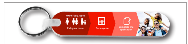
#5401 Shown with Optional Backside Imprint †

*PhotoImage ® Full Color Imprint Setup Charge: 55.00 (G) for one-sided imprint or same artwork used on both sides. If 2nd side imprint is a different image, add 55.00 (G) setup charge. Please note nail files and vinyl sleeves are packed bulk separately. To insert files into vinyl sleeves please add .25 (G) each and specify. Price Includes: up to a Full Color Imprint on one side of nail file. 2nd side imprint is available for additional charge shown in price chart.