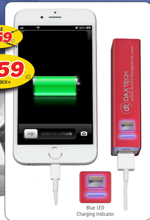
Ideal for charging mobile phones