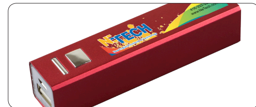
#PB1024 Shown with 4 Color Process Imprint*