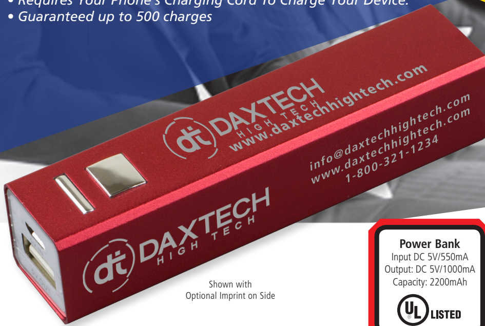
Shown with Optional Imprint on Side