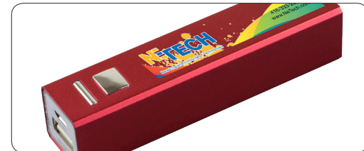
#PB1024 Shown with 4 Color Process Imprint*