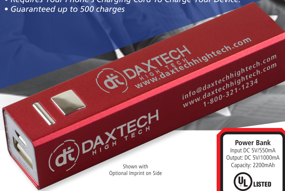
Shown with Optional Imprint on Side