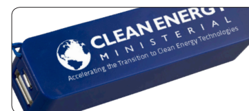
Shown with Optional Backside Imprint