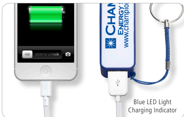
Blue LED Light Charging Indicator

UL File #MH61064, XRN Series – The Power Bank and all of its components, standards and performance comply with the rigorous standards of the UL, the premier product safety, certification and testing laboratory in the World.