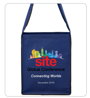
Shown with Optional 4 Color Process Imprint*

Setup Charge: 50.00 (G) per color, per location. Price Includes: One color imprint, one location. 2nd Color/Location Imprint: add