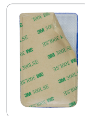
3M Adhesive Backing

Setup Charge: 50.00 (G). Price Includes: One color imprint, one location. One Color, One Location only. PMS Color Match Charge: 32.00 (G). Email Proof Charge: 7.50 (G), add 2 days to production time. Repeat Setup Charge: 25.00 (G). Production Time: 5 Days. Packaging: Bulk w/Instruction Sheet Inserted.