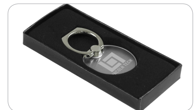
Gift Box included

Laser Engraving Setup Charge: 55.00 (G) per location. Price Includes: Laser engraving, one location. Email Proof Charge: 7.50 (G), add 2 days to production time. Repeat Setup Charge: 25.00 (G). Production Time: 5 Days. Packaging: Gift Box