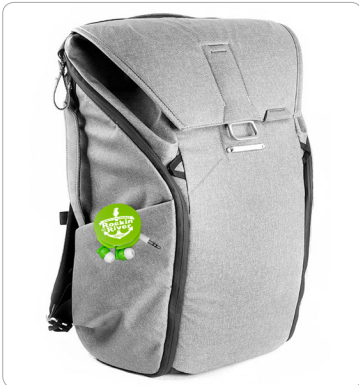
Clip onto belts, pockets or bags.