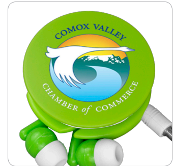
Shown with Photolmage © Full Color Imprint*

Screen Setup Charge: 55.00 (G) per color. Price Includes: One color imprint, one location. PMS Color Match Charge: 40.00 (G) per color, not available for Full Color Imprint. *Photolmage © Full Color Imprint: add .30 (C) running charge plus 55.00 (G) Setup Charge. Price Includes: Up to a 4 color process imprint. Exact color match for Full Color Imprint is not guaranteed. Email Proof Charge: 7.50 (G), add 2 days to production time. Repeat Setup Charge: 25.00 (G). Production Time: 5 Days.