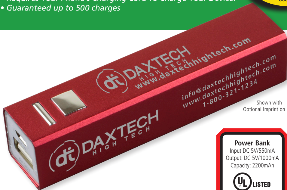
Shown with Optional Imprint on Side