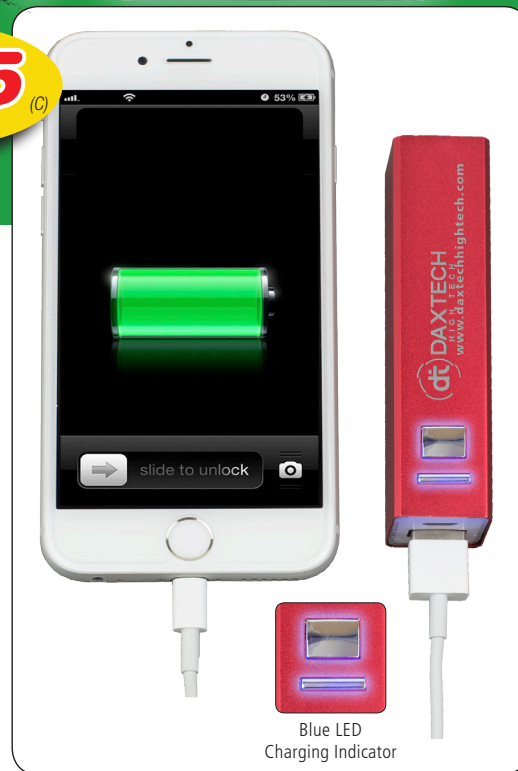
Blue LED Charging Indicator

Power Bank Input DC 5V/550mA Output: DC 5V/1000mA Capacity: 2200mAh