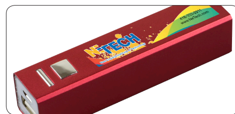
PB1024 Shown with 4 Color Process Imprint*

Size: 3-11/16" W x 13/16" H Laser Imprint: 2-5/8 W" x 1/2" H Optional Backside Imprint: 3-1/2" W x 1/2" H Input: 5 Volts DC; Output: 1000mAh. Capacity: 2200 mAh.