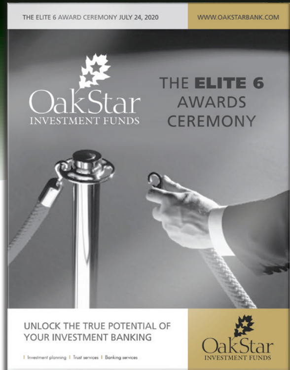
Shown with PhotoImage® 4 Color Process Imprint

These plaques utilize a state of the art printing process to create beautiful but economical four color graphics. The printing is on the backside so that the images appear to float inside the plaques. PhotoImage® Plaques are also available with Digital Personalizations or variable data copy together with the 4 color process imprint.