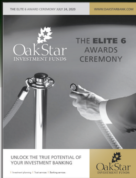
Shown with PhotoImage® 4 Color Process Imprint

These plaques utilize a state of the art printing process to create beautiful but economical four color graphics. The printing is on the backside so that the images appear to float inside the plaques. PhotoImage® Plaques are also available with Digital Personalizations or variable data copy together with the 4 color process imprint.