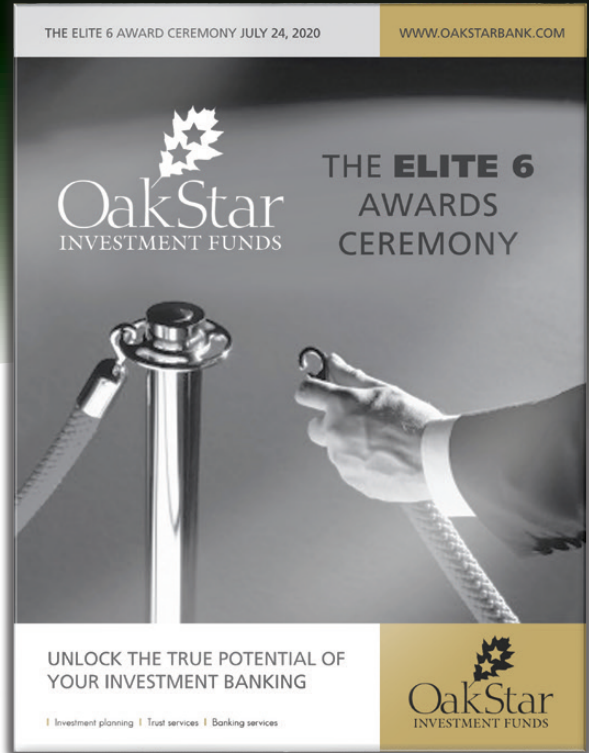
Shown with PhotoImage® 4 Color Process Imprint

These plaques utilize a state of the art printing process to create beautiful but economical four color graphics. The printing is on the backside so that the images appear to float inside the plaques. PhotoImage® Plaques are also available with Digital Personalizations or variable data copy together with the 4 color process imprint.