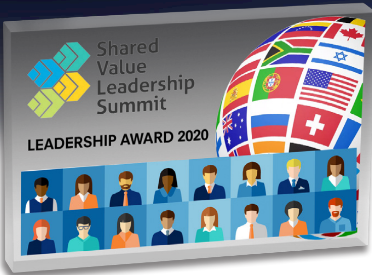
Shown with PhotoImage® 4 Color Process Imprint

Acrylic paperweights are a budget friendly way to award the best in your organization. These quality awards are a great reminder of a job well done. Screen printing keeps costs low and optional laser engraving adds a personal touch.