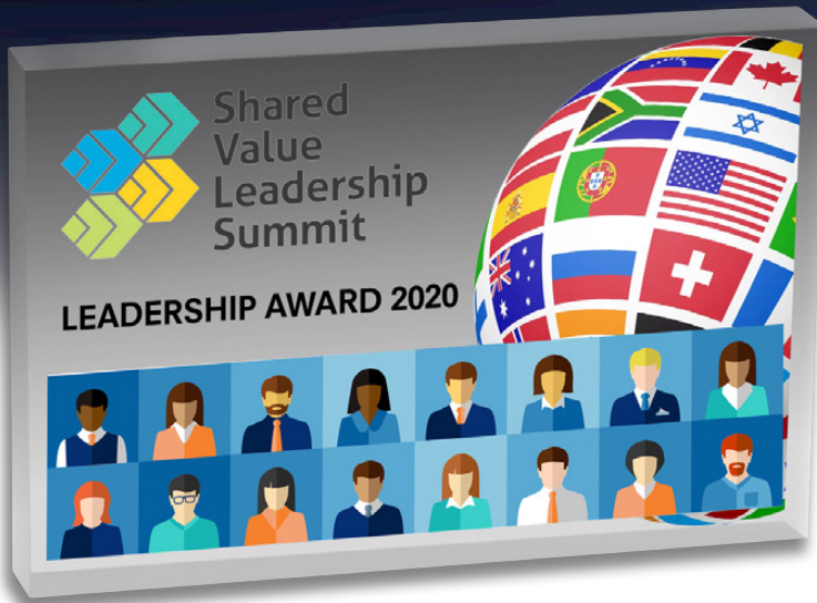
Shown with PhotoImage® 4 Color Process Imprint

Acrylic paperweights are a budget friendly way to award the best in your organization. These quality awards are a great reminder of a job well done. Screen printing keeps costs low and optional laser engraving adds a personal touch.