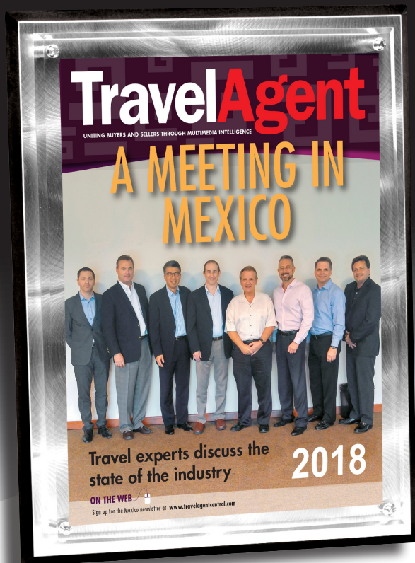
#1378 Alumo-Tech Plaque Shown with 4 Color Process Imprint

These plaques feature decorative aluminium mounted on black acrylic with a suspended clear acrylic imprint panel and designer chrome hardware. Choose a Laser Engraved, Screen Printed or 4 Color Process Imprint.