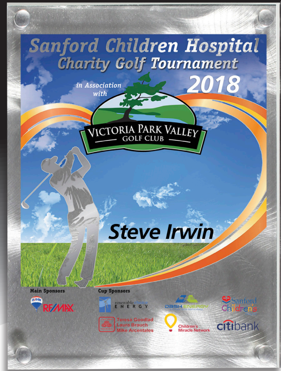
#1431 Alumo-Tech II Plaque Shown with 4 Color Process Imprint and Digital Personalization