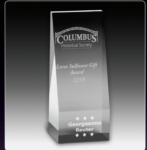
#2252 Shown with Laser Engraved Imprint and Laser Engraved Personalization