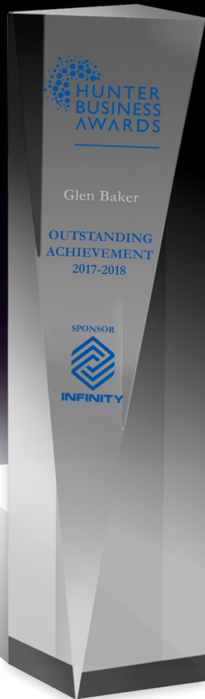
#2257 Shown with Screen Imprint and Laser Engraved Personalization