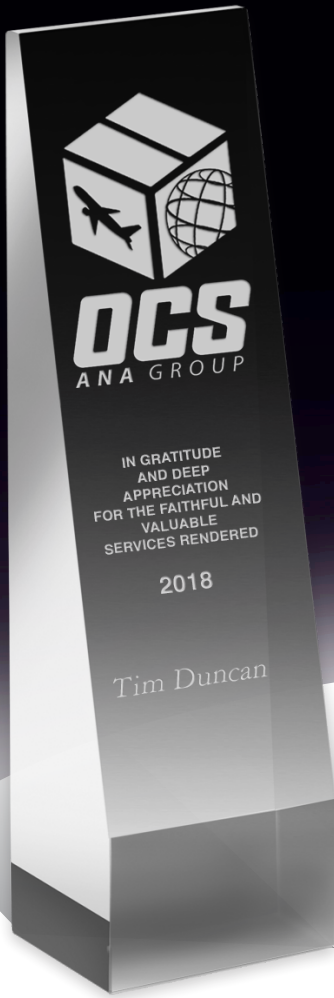
#2253 Shown with Laser Engraved Imprint and Laser Engraved Personalization

These 2" thick tall and elegant multi faceted awards make a recognition impact the recipient will never forget! They can be Screen Printed or Laser Engraved.