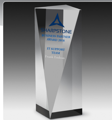
#2256 Shown with Screen Imprint and Laser Engraved Personalization