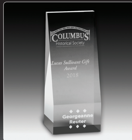
#2252 Shown with Laser Engraved Imprint and Laser Engraved Personalization

Shown with Screen Imprint and Laser Engraved Personalization