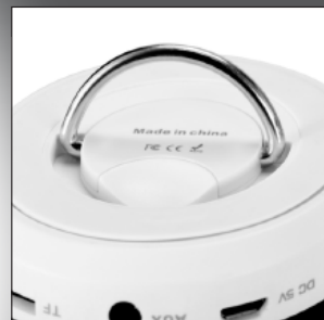
Bottom with Hanging Hook