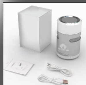
Box includes micro charging cable, AUX cable and user manual.