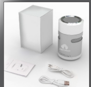
Box includes micro charging cable, AUX cable and user manual.

***This price is only good till August 1st 2018