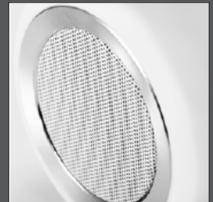
Top - Speaker