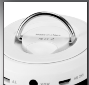
Bottom with Hanging Hook