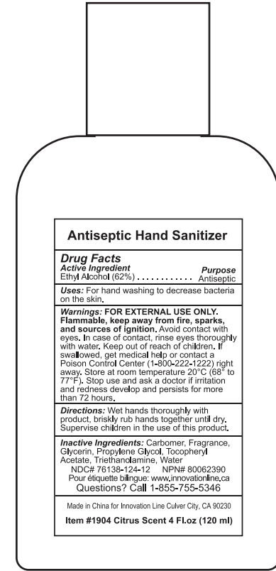
Ingredients Label on Back